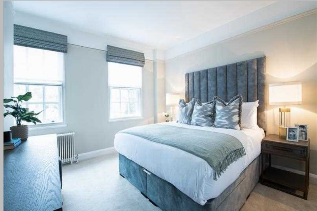
A stylish two-bedroom apartment set within a classic Edwardian style building in the heart of Chelsea.