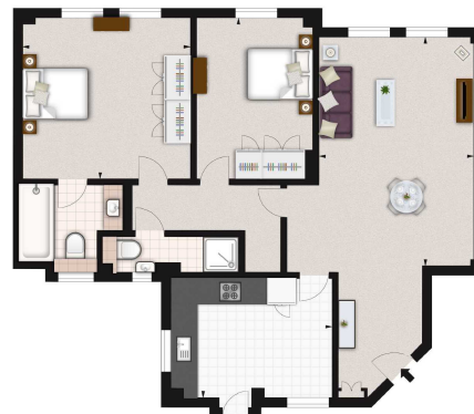
ILLUSTRATION FOR IDENTIFICATION PURPOSES ONLY. NOT TO SCALE * As Defined by RICS - Code of Measuring Practice

APPROX. GROSS INTERNAL AREA* 845 Ft 2 - 78.50 M 2