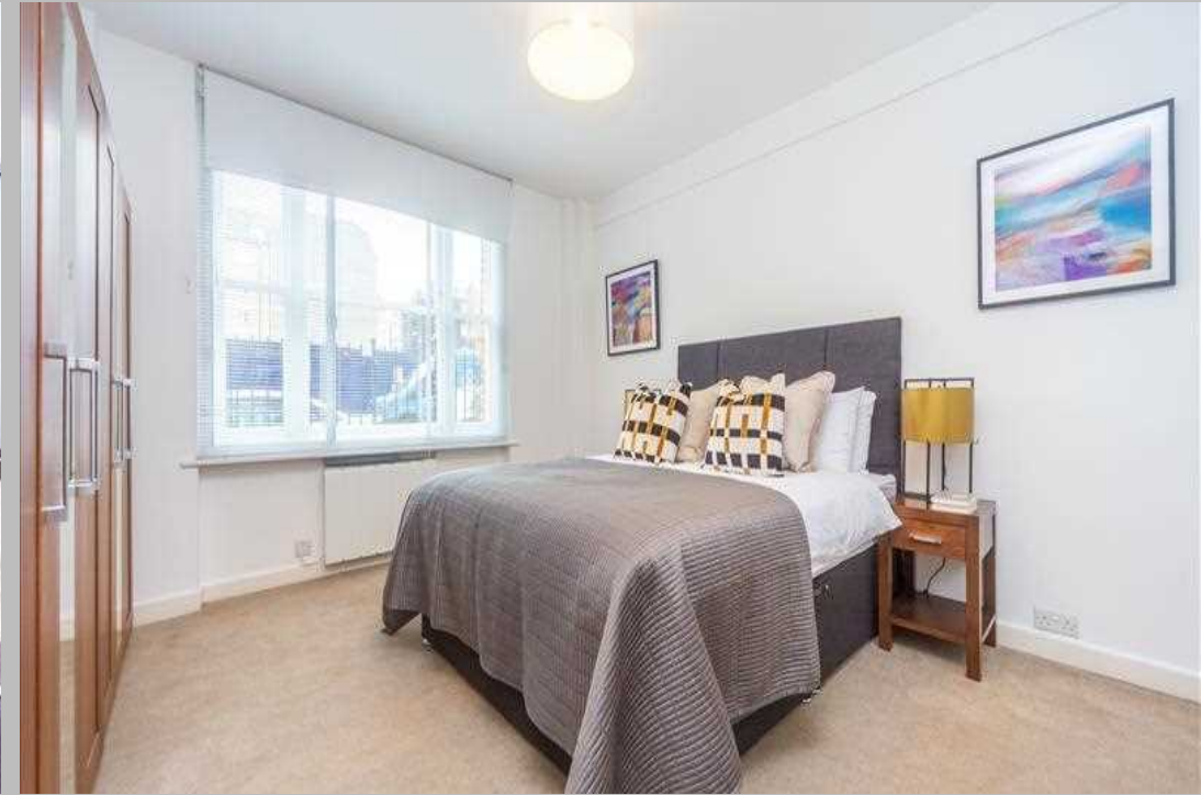
A sophisticated one-bedroom apartment set within a stunning Art Deco style building in Mayfair.