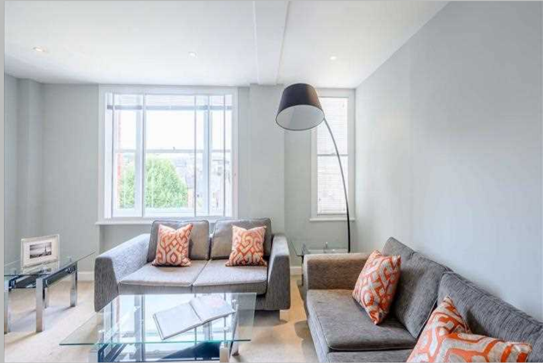
A gorgeous two-bedroom apartment set within a beautiful Art Deco style building in Mayfair.