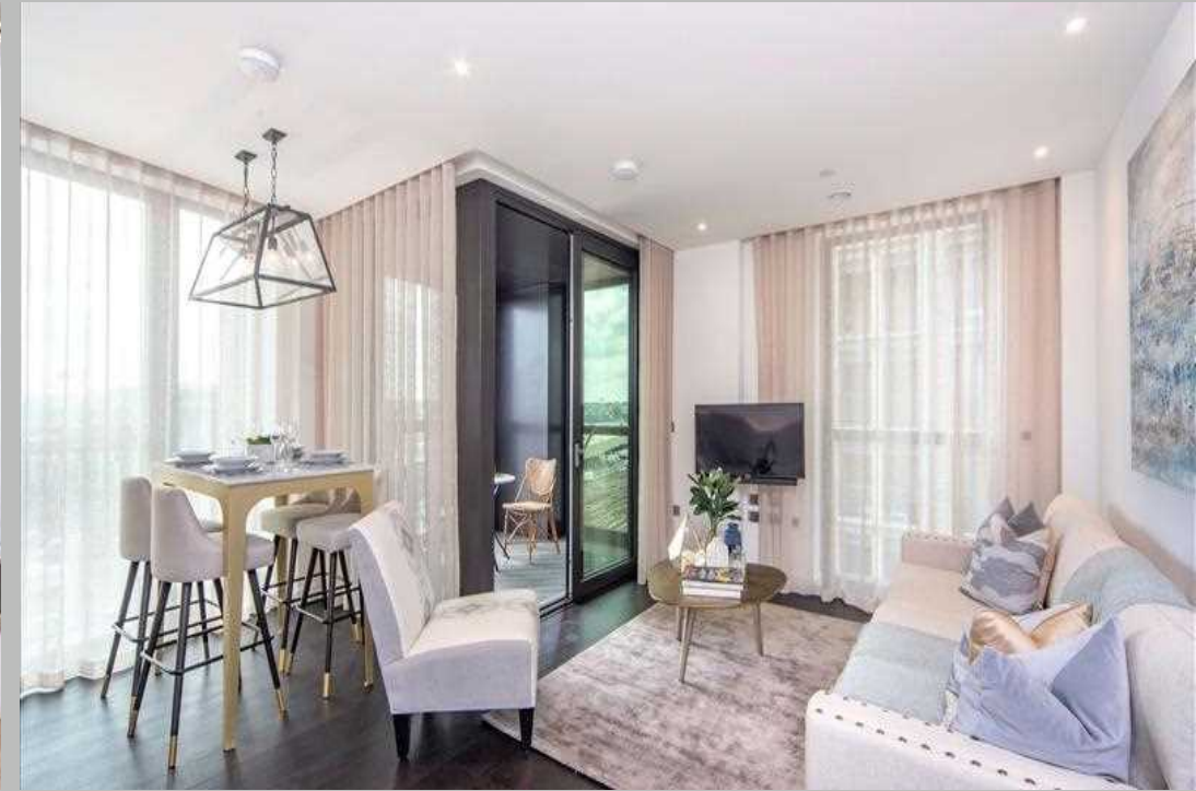
A stunning two-bedroom apartment set within the prominent Thornes House development in Nine Elms.