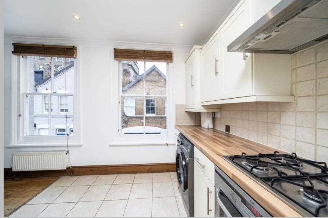
A stunning, contemporary 1st and 2nd floor maisonette set in a beautiful cobbled mews