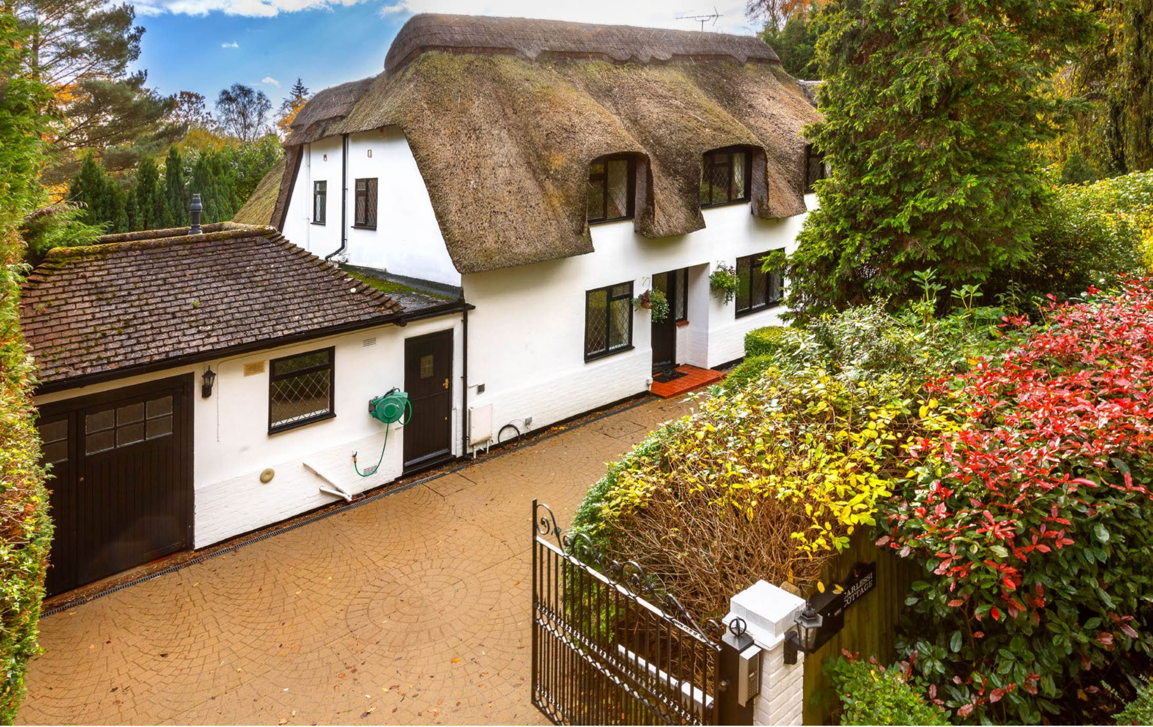
CARLESSI COTTAGE SUNNINGDALE